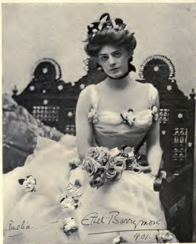
MISS ETHEL BARRYMORE as Aurelia Johnson — "Madame Trentoni"